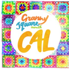
Square 7 - @craftingbylucy